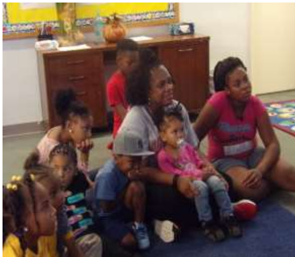
Parent/Child Literacy Night