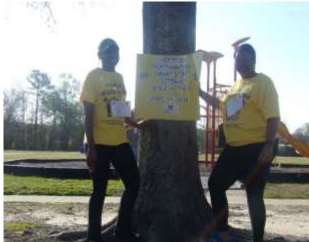
Literacy Walk a Thon