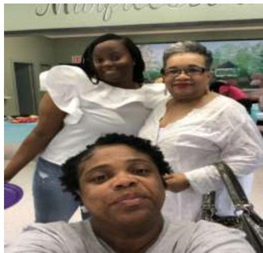
Providers Appreciation Dinner/Paint Party