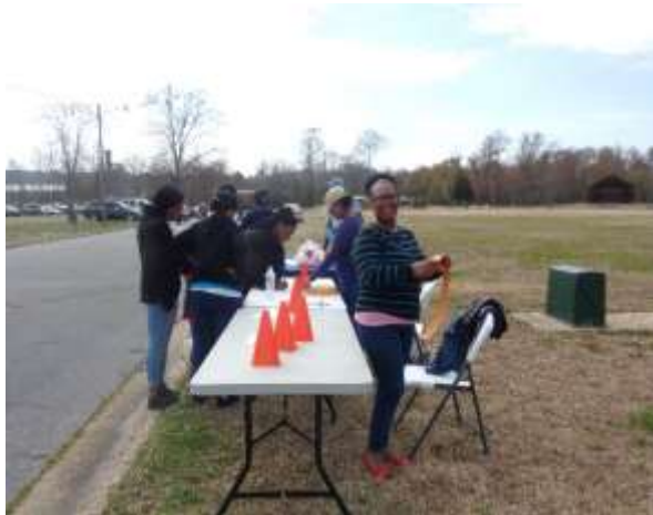
Week of the Young Child Egg Hunt