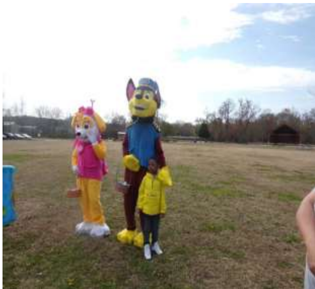
“Week of the Young Child Egg Hunt”