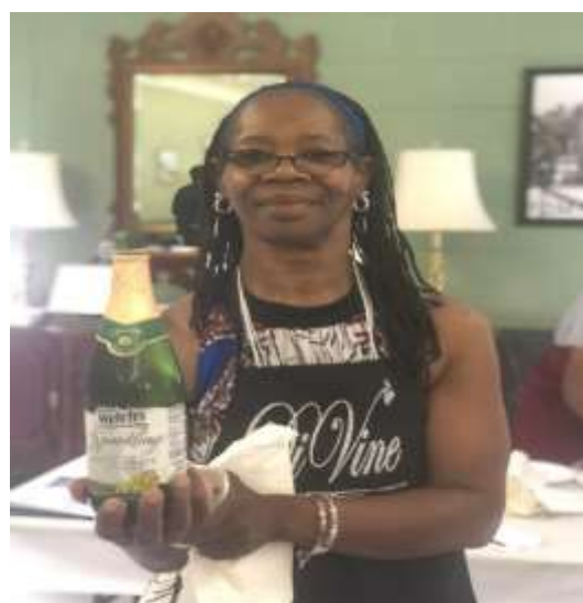
Providers Appreciation Dinner/Paint Party