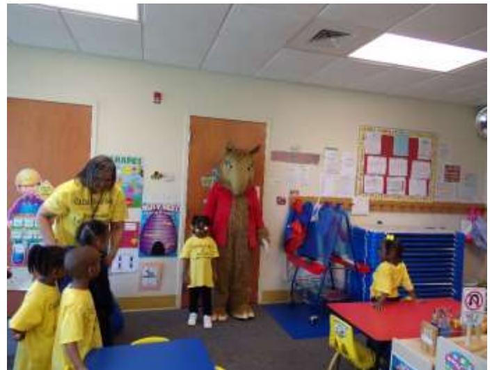
Week of the Young Child: Story Time with Llama Llama