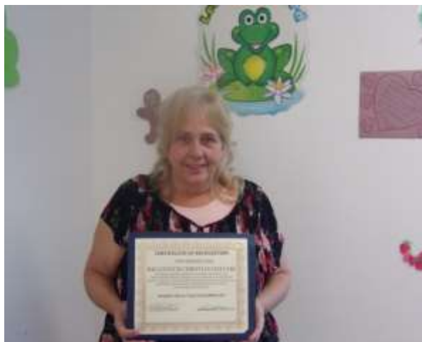
Center of the Month