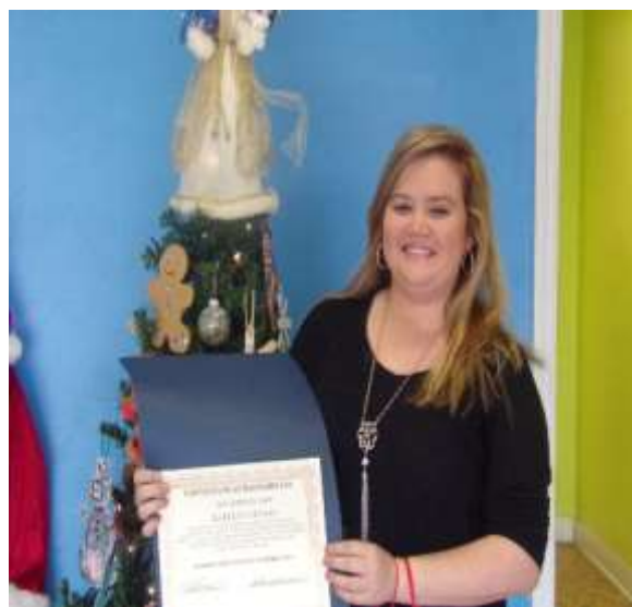
Providers of the Month